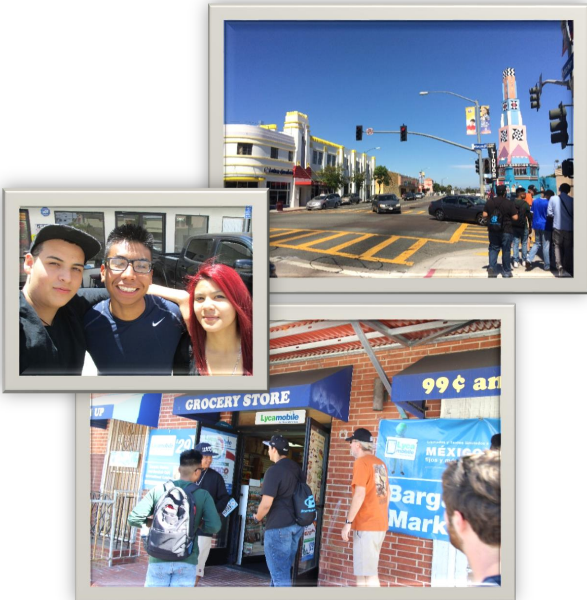
Crawford students enjoy conducting fieldwork in the neighborhood during the summer.

7/19/2016: The project is completed. From June 23 to July 19, a group of six students who have demonstrated substantial leadership met at SDSU to continue to work on the project with the SDSU researchers. The students conduct interviews, taking the total number of people included in the project over our goal to a total of 105. They conduct photo explorations of the neighborhood and learn landscape interpretation techniques, and they work on building a website to share their work.