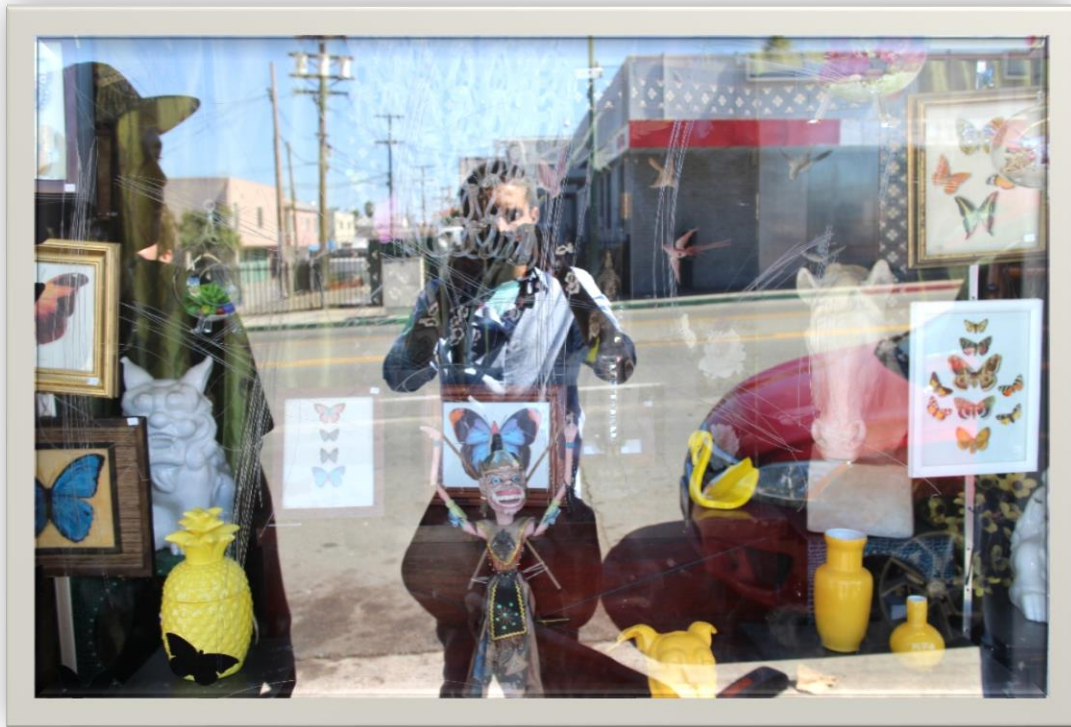
A Crawford High School student examines the neighborhood landscape while conducting research for the Crawford Community Kaleidoscope Project.